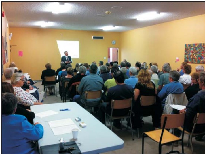
Our 1 st Estate Planning Seminar was a big success! Held on May 26 th at 6:00 PM in the Springfield Public Library