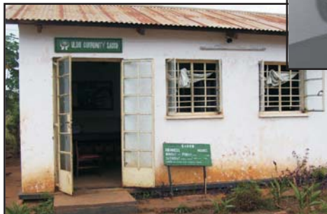
A typical credit union in Malawi, Africa